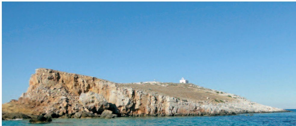
Fig. 2: The small islet of Agios Ioannis.

mentioned by WERNER (1935) and BUTTLE (1993). Overall, the authors observed and caught more than twice as many males as females. During the summer, the lizards followed a bimodal activity pattern with peak activity periods in the morning and late in the afternoon. On Ag. Ioannis, P. erhardii was also the dominant reptile (up to six individuals per 100 m transect). The lizards ranged widely across the islet and made extensive use of the Atriplex bushes for shelter. Lizards from Folegandros and Ag. Ioannis were similar in size but those from the latter were less fearful (i.e., allowed closer approach) and were frequently engaged in intense agonistic interactions. In line with this observation, 73 % of the animals on Ag. Ioannis had regenerated tails, whereas this proportion was only 34 % on Folegandros. This difference is statistically significant ( \chi^2 = 24.08, p < 0.01 ).